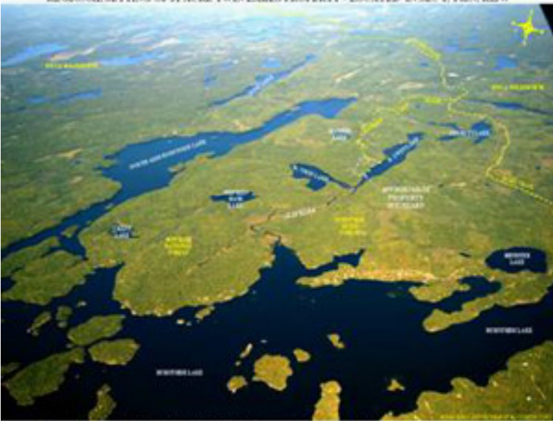
25 ACRE LOT LAYOUT OF TWIN LAKES PROPERTY - IN SEC 14, NW 1/4 OF SEC 1, T4N, R13W

(Wingfield, W. & BMR) (Lake & BMR) (etc.)